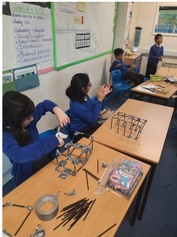
Building structures to withstand an earthquake in Y5