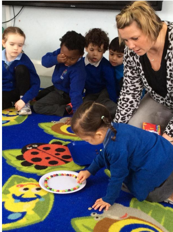
3 - Observing in nursery