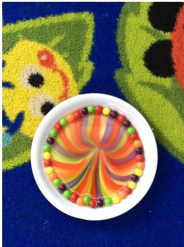
4 - Look what happened!

Can you see a moon rover below? This was one was designed by Phoebe in Y3. Well done!