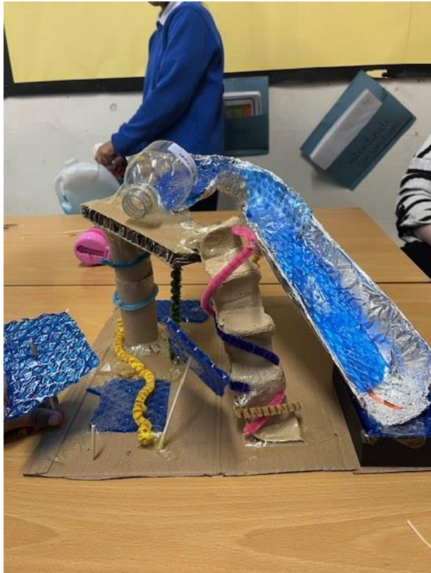
Building a water slide for the eco water park in Year 4. These look fantastic!