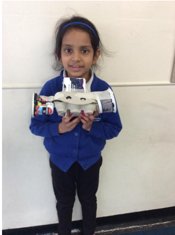
1 - Engineers in the making!