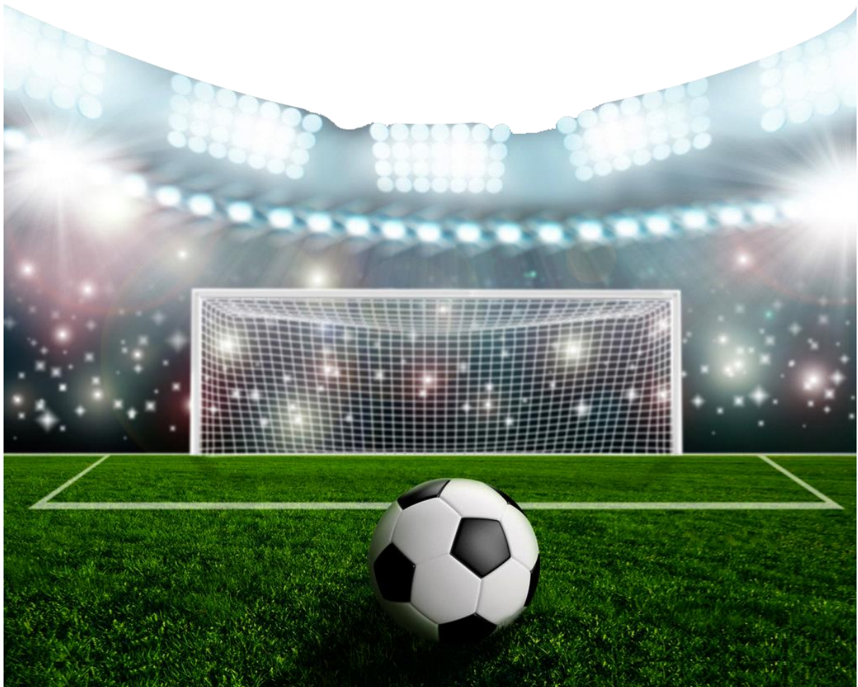
New Marston 3 - 1 St. Nicholas