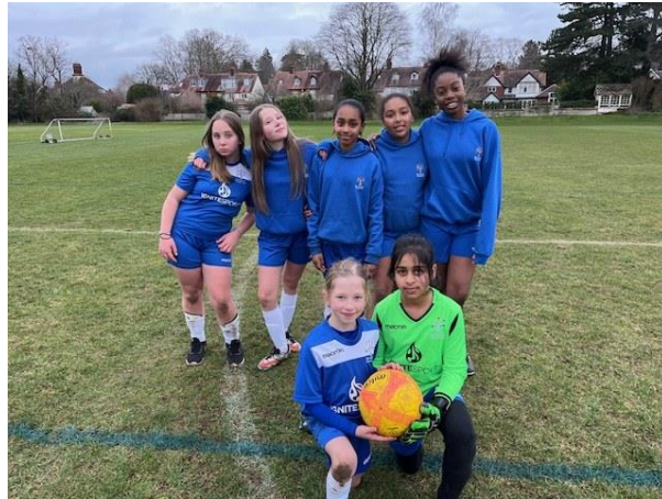
Football (Match 2)